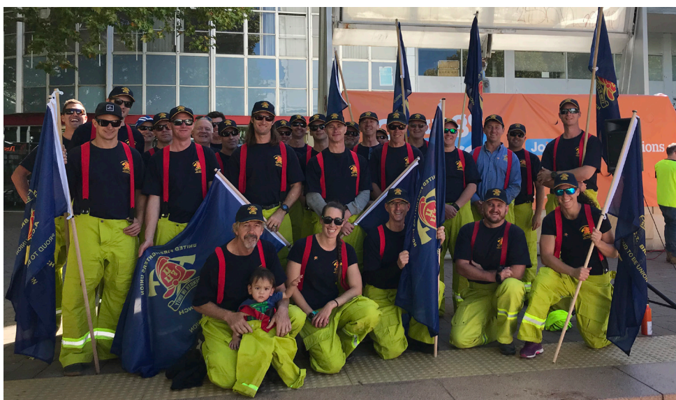
Image: Firefighters rally in support of workplace rights, 2019.

However, there are two important qualifications to this data. First, labour costs per FTE are relatively low ($108,804 for the ACT of $115,890 for Australia as a whole) and have been falling in real terms quite markedly over the last 5 years (by more than 17%). In addition, the Productivity Commission's data includes all staff employed by the fire services and not just fire fighters. We saw earlier that in the ACT fire services are dominated by paid employees, whereas the other states and territories rely much more heavily on a largely unpaid, volunteer workforce. Also, in the ACT the fastest growth in employee numbers has been in support staff not firefighters. Finally, the figures for Australia as a whole will be disproportionately affected by the comparatively low paid workforce of NSW, the only workforce to have experienced a faster real decline in labour costs per FTE than the ACT. For all these reasons, we believe it would be highly misleading to portray the ACT Fire and Rescue Service as inefficient.