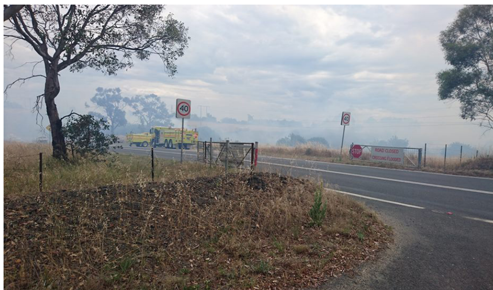
Image: Compressed Air Foam System (CAFS) Tankers en-route to a grass fire. Canberra led the nation in the commissioning of these appliances following the 2003 fires.