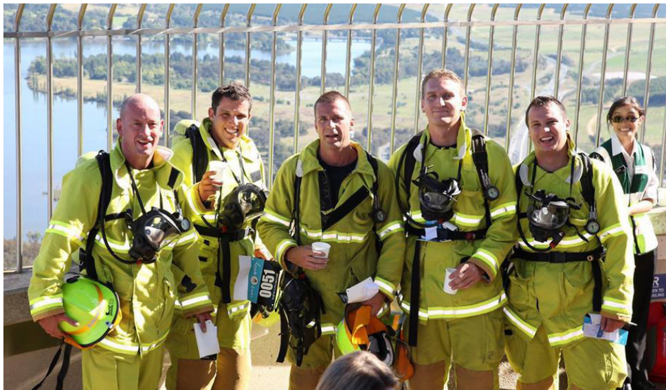
Image: Firefighters participating in the Camp Quality Verticool Challenge, 2012.

Source: Productivity Commission, Report on Government Service Provision, 2019 , Canberra