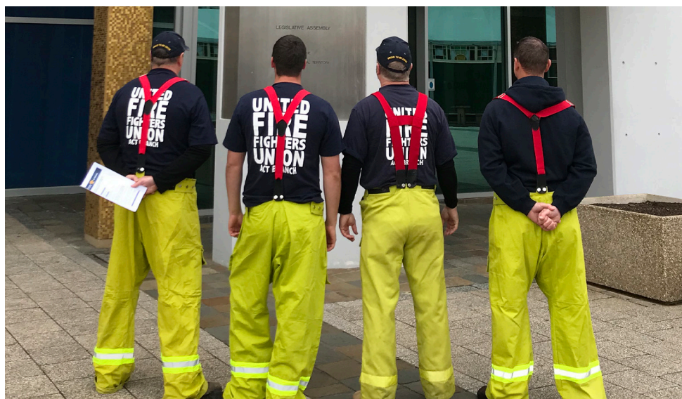
Image: Firefighters took their concerns to ACT politicians in early 2019